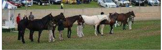
Above: Led ASH Mare, 4 years and over