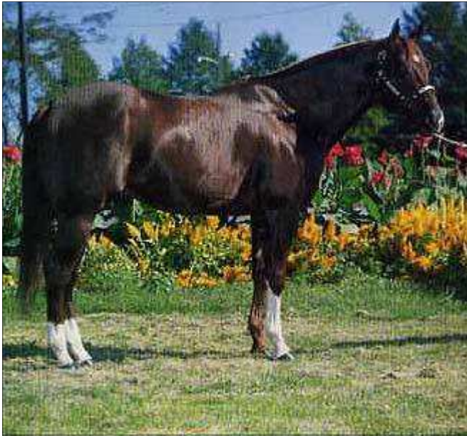
Above: Well defined tendons, neck adequate but thickish