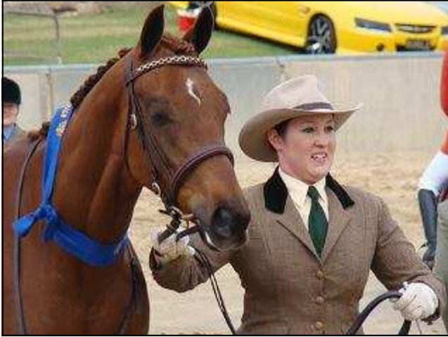
Above: Led ASH Filly, under 3 years— 1st Memphis Park Newmarket & Crystal